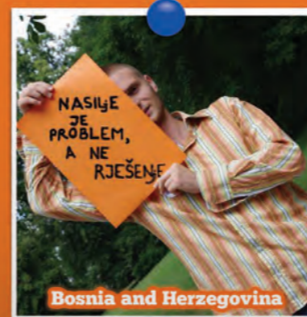
Bosnia and Herzegovina