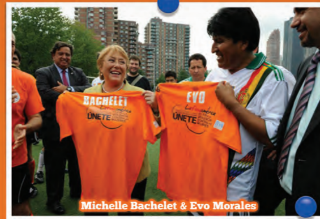
Michelle Bachelet & Evo Morales