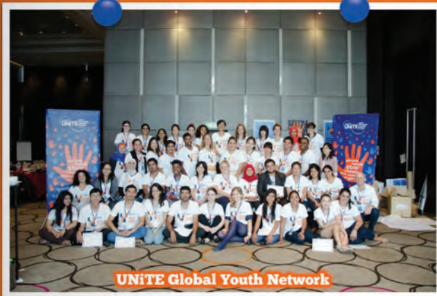
UNiTE Global Youth Network