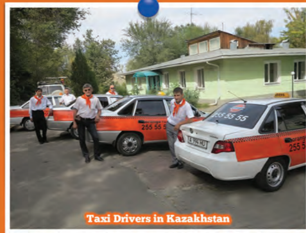
Taxi Drivers in Kazakhstan