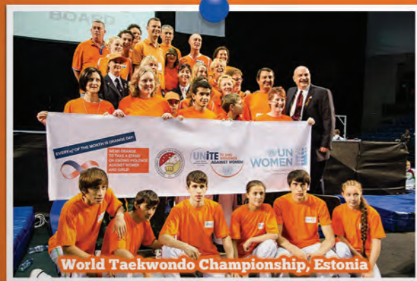
World Taekwondo Championship, Estonia